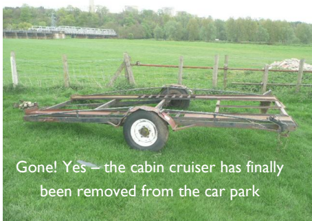
Gone! Yes – the cabin cruiser has finally been removed from the car park

This simple facility has been introduced following the problems we have had in previous seasons with mud and bird droppings being walked into the club house and changing rooms.