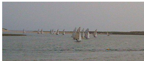
Burnham